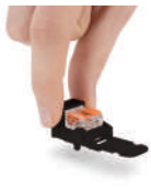
Horizontal mounting via snap-in foot