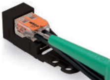
Testing a connector mounted on the carrier via test slot.