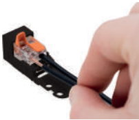
Inserting a conductor.