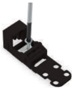
Horizontal screw mounting