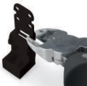
The strain relief plate can be removed.