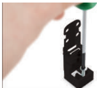
Vertical screw mounting