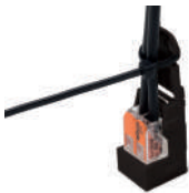
Use a cable tie to secure the conductors to the strain relief plate.