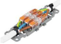
3-pole mounting carrier with strain relief