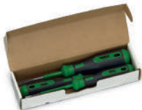
Set of operating tools in a box