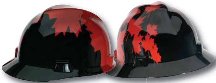
Canadian Black with Red Maple Leaf Cap and Hat