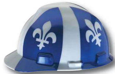
Fleur de Lys Cap