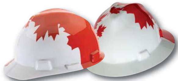
Canadian White with Red Maple Leaf Cap and Hat

Note: this bulletin contains only a general description of the products shown. While uses and performance capabilities are described, under no circumstances shall the products be used by untrained or unqualified individuals and not until the product instructions including any warnings or cautions provided have been thoroughly read and understood. Only they contain the complete and detailed information concerning proper use and care of these products.