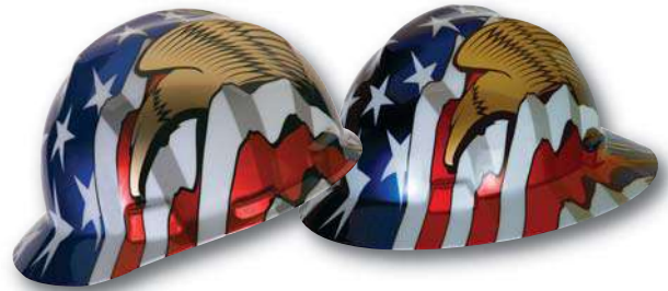
American Flag and 2 Eagles Cap and Hat