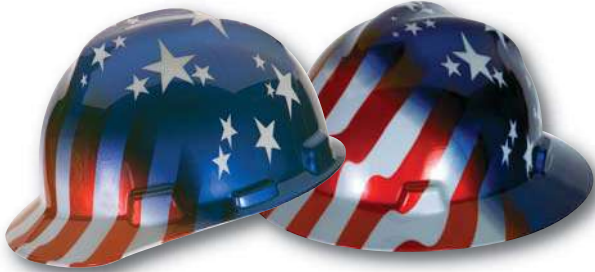
American Stars and Stripes Cap and Hat