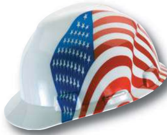
Dual American Flag Cap