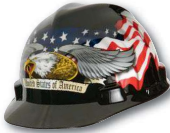
American Eagle Cap