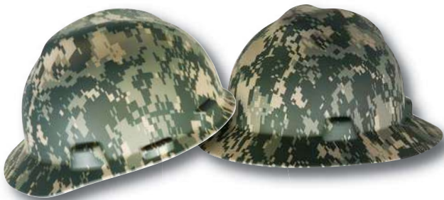
Camouflage Cap and Hat