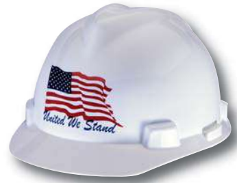
"United We Stand" Cap