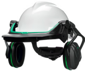
V-Gard Hearing Protection, Low; V-Gard® Frame