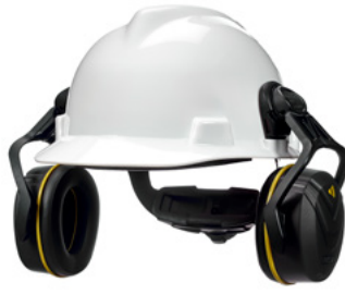
V-Gard Hearing Protection, Medium