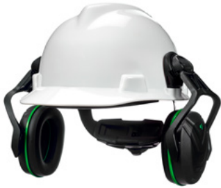
V-Gard Hearing Protection, Low