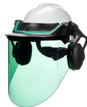
V-Gard Hearing Protection, Low; V-Gard Frame with Debris Control; V-Gard PC Heavy Duty Purpose Visor