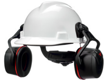
V-Gard Hearing Protection, High