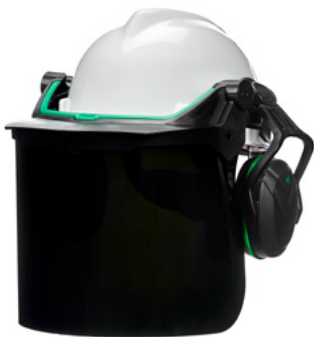
V-Gard Hearing Protection, Low; V-Gard Frame; V-Gard Shade 5 Welding Visor