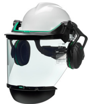
V-Gard Hearing Protection, Low; V-Gard Frame; V-Gard General Purpose Visor w/Nitrometer & Chin Protection

For a full listing of V-Gard accessories and part numbers, please see the Above-the-Neck Protection Solutions Catalog .