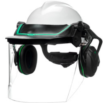
V-Gard Hearing Protection, Low; V-Gard Frame with Debris Control; V-Gard General Purpose Visor