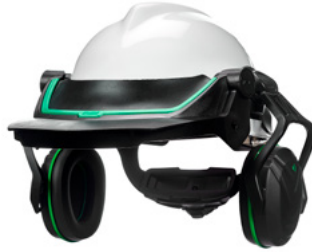
V-Gard Hearing Protection, Low; V-Gard Frame with Debris Control