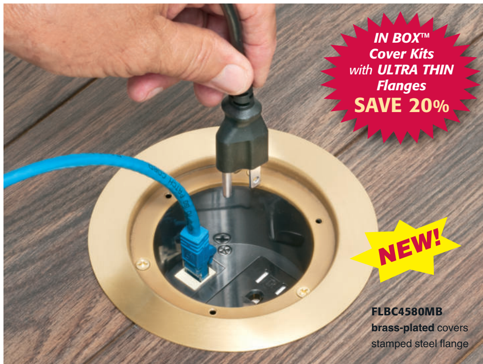
FLBC4580MB brass-plated covers stamped steel flange

Ultra-Thin Flanges for Economy and Good Looks