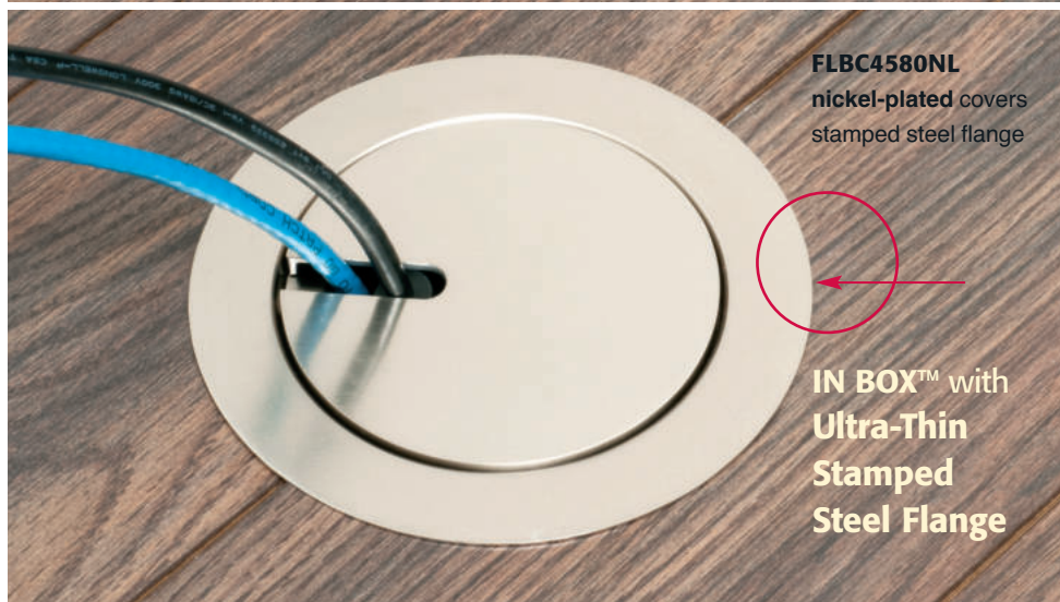
FLBC4580NL nickel-plated covers stamped steel flange

IN BOX™ with Ultra-Thin Stamped Steel Flange