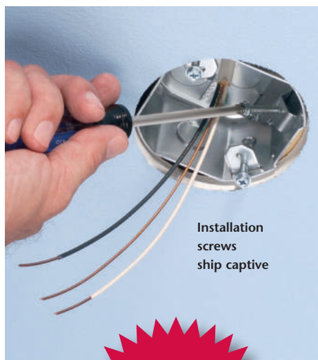
Installation screws ship captive