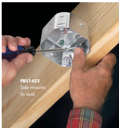
FBS1423 Side mounts to stud

For New Work or Old • Side-mounts Securely to Joist