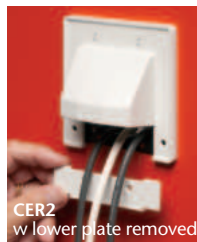
CER2 w lower plate removed