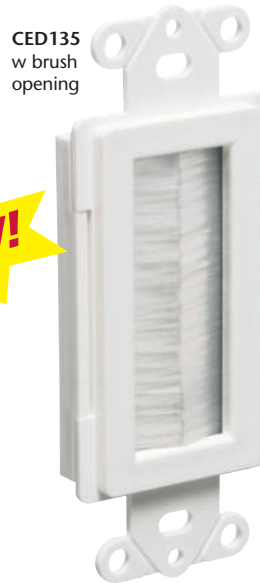
CED135 w brush opening