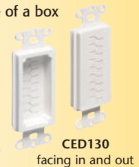
CED130 facing in and out

See our full line of SCOOP Entrance Plates, Hoods and Entry Devices on reverse.