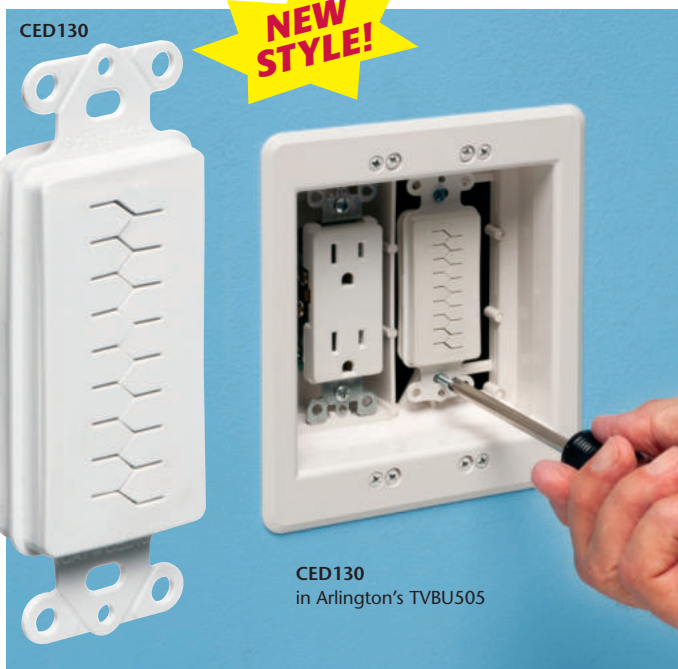
CED130 in Arlington's TVBU505

1 Stauffer Industrial Park Scranton, PA 18517 800/233.4717 Fax 570/562.0646 www.aifittings.com