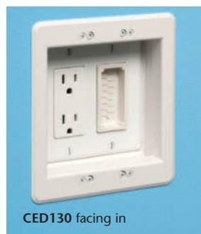
CED130 facing in