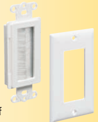
CED135WP w wall plate

Both are available with a decorator-style wall plate.