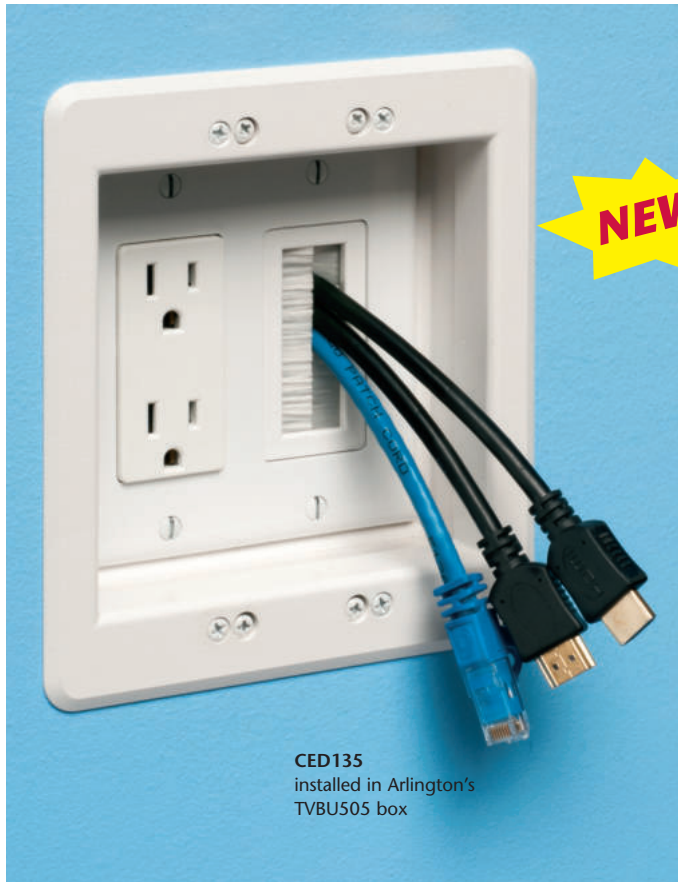
CED135 installed in Arlington's TVBU505 box

The Attractive Way to Organize and Protect Cable